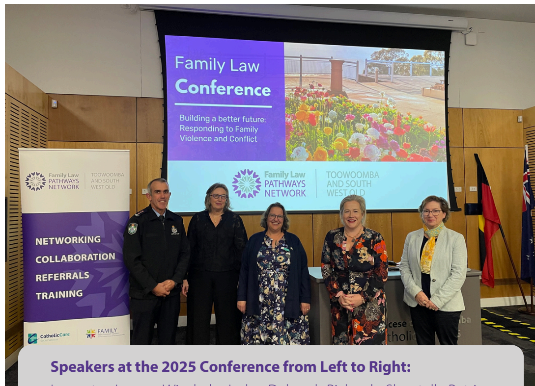
Speakers at the 2025 Conference from Left to Right: